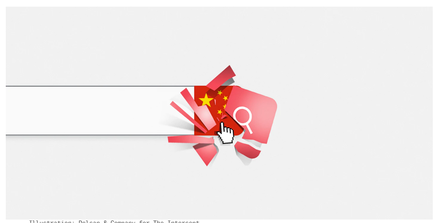
Illustration: Delcan & Company for The Intercept

Shutterstock, the well-known online purveyor of stock images and photographs, is the latest U.S. company to willingly support China's censorship regime, blocking searches that might offend the country's authoritarian government, The Intercept has learned.